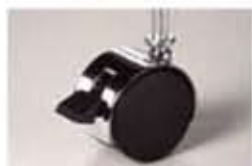
Locking Casters (optional)