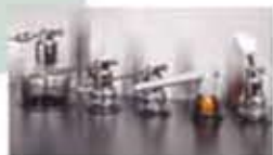
Extra DeVilbiss Glassware Openings (optional)