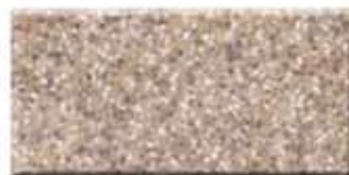
Khaki Brown Tempest (standard on beige Alucobond only)