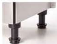
3" Extension Legs (optional)